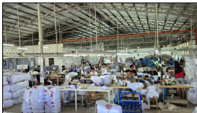
NIA Road, Bustos, Philippines, 3007