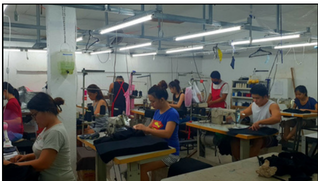
185 I. Lopez Street Poblacion, Mandaluyong, Philippines

A First-Choice Partner for supplying quality Bags and Clothing Uniforms that suit the needs of every organization.